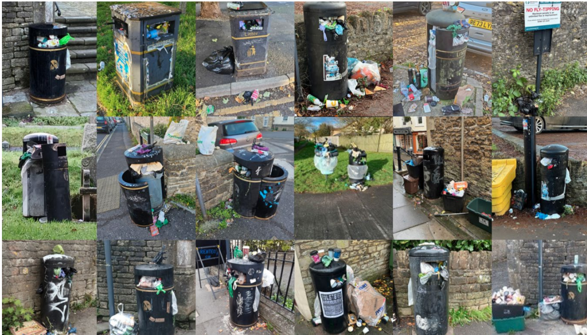
Figure 2 - Examples of bins unemptied by SC in 2025/26

The contract with SC covers not only the emptying of the bins themselves but also litter picking within the play areas but this has also not been consistently undertaken.