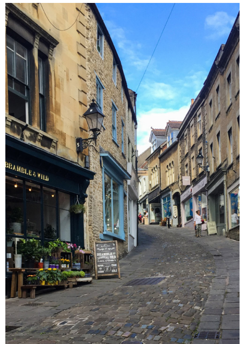
Frome town centre, Catherine Hill

The commercial space offered at our Saxonvale development is ideally located to attract both local visitors and those from further afield.