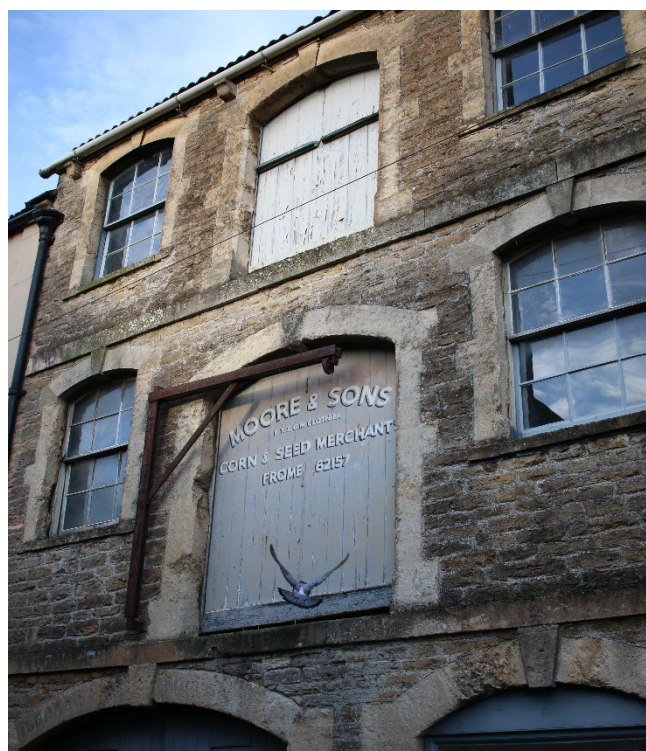
South Parade. Moore and Sons, Corn and Seed Merchants. Approx. mid-C19. Coursed rubble with hipped pantile roof. 3-storey hoist opening to centre of 1st and 2nd floors, sash window with glazing bars each side. Wide cambered head archway with keystone to ground floor (Historic England).