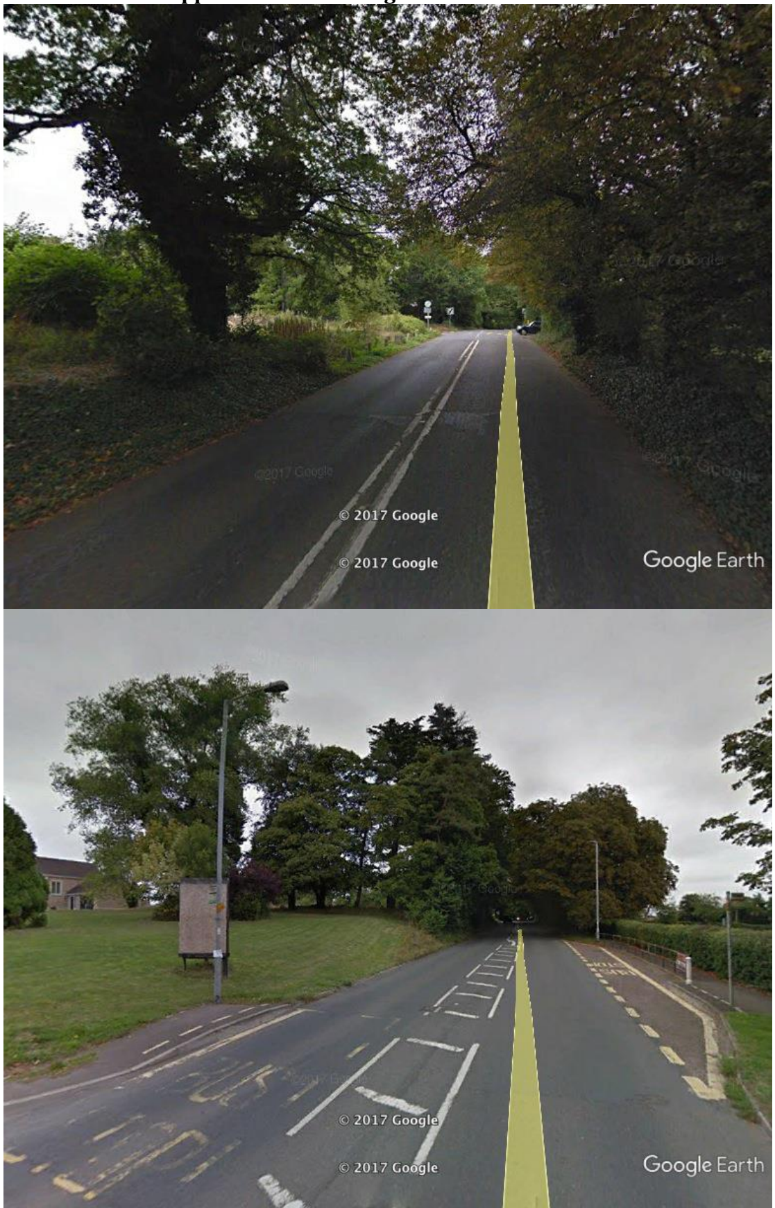
Bath road heading from Frome towards Gypsy Lane/Cuckoo Lane Junction