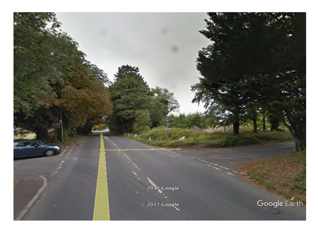
Bath Road/Frome College/Development Site