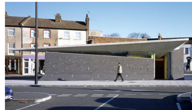
These images are an artist's impression only