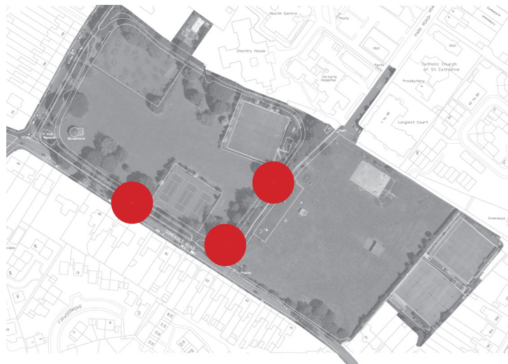
Possible locations for new toilet facilities

Replace building with new toilets Improved visual appearance Improve accessibility features Improved supervision of entrances Improve durability and ease of cleaning Improve ventilation, windows and lighting