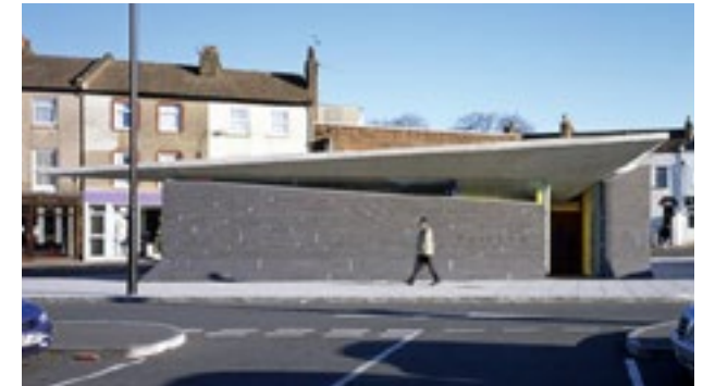
These images are an artist's impression only