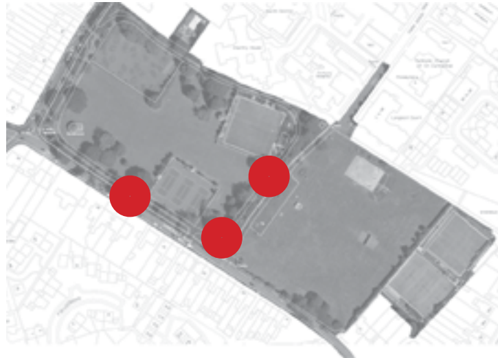
Possible locations for new toilet facilities

Replace building with new toilet facilities - Improved visual appearance Improve accessibility features Improved supervision of entrances Improved durability and ease of cleaning Improved ventilation windows and lighting