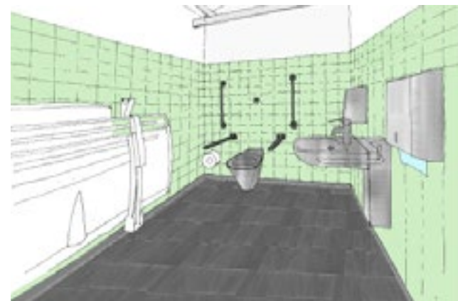
No change to external appearance